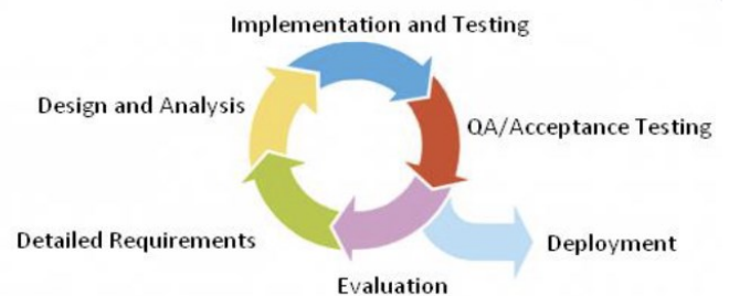
Fig. 1. Agile Process [8]

In order to ensure that the preliminary specifications and user requirements are aligned with what the user wants, a requirements-gathering phase was conducted before developing the system. As part of the development, testing, and release of the system, multiple iterations were conducted to develop, test, and release features. As part of testing, validation, and verification were performed to ensure the functionalities were by the expectations of the user and that all functionalities were functioning properly. If the requirements change during the development process, the features of the system will be tweaked again to meet the latest requirements, as shown in Fig. 1.